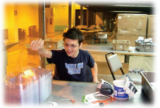
Program Outcomes 2021-2022

Annual Youth Job Fair: By partnering with local employers (such as Camelback, Kalahari, Shawnee Inn, Cove Haven, Great Wolf, McDonalds, Burger King, Wendy’s, Shoprite, Price Chopper, and more), YES hosts an annual youth job fair every May since 2015, intended for high school and college students seeking summer employment. The goal is to fill summer seasonal positions with local youths ages 14 to 24.